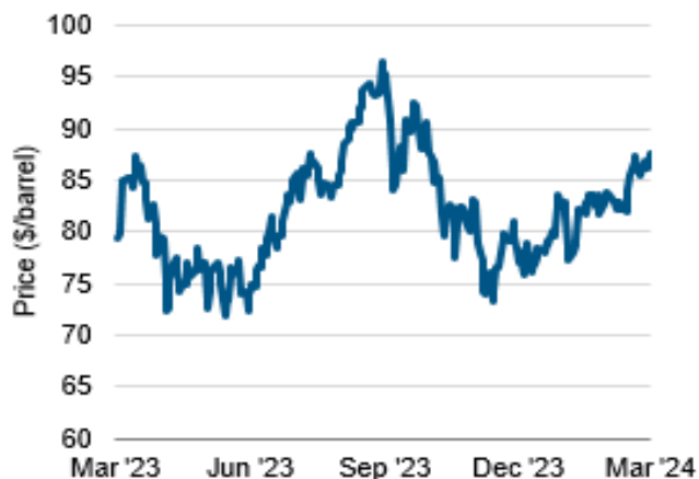
Brent front-month contracts