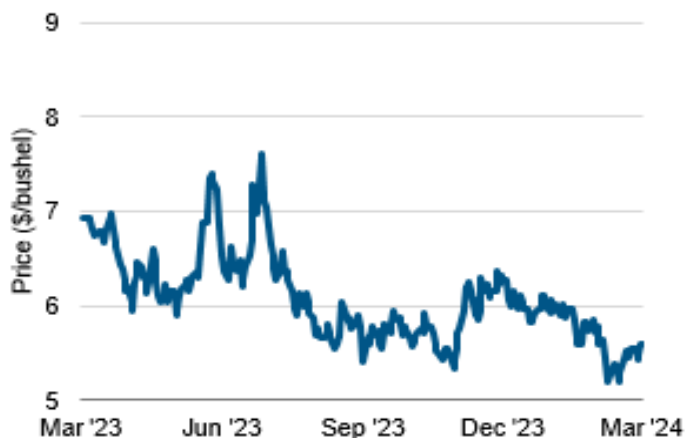
Wheat front-month contracts